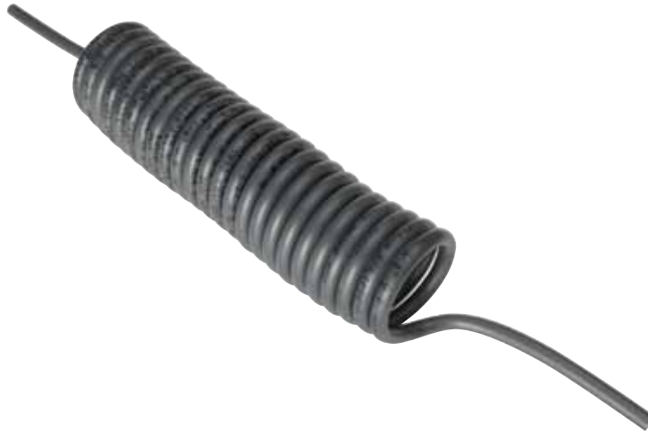
Table 3-14: Hose - Fifth Wheel Thermoplastic Slider Coil