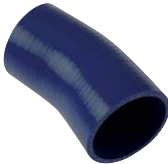
Table 3-87: Hose - Radiator Hose - 2-1/2" Silicone ISM T