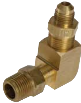
Table 3-16: Hose - Fuel Hose - Fuel Line Return Assembly