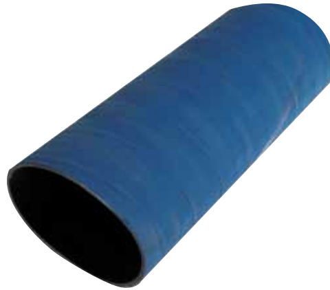
Table 3-91: Hose - High Performance Magnum Aramid Radiator Hose (Severe Service)