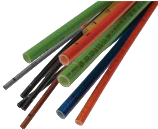
Table 3-10: Hose - Undercab Harness Hose