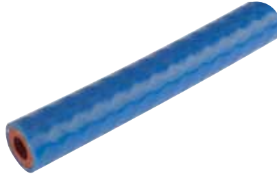
Table 3-21: Hose - Extreme Temperature Silicone Value Wall Heater Hose