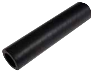
Table 3-23: Hose - High Performance Magnum Aramid Heater Hose (Severe Service)