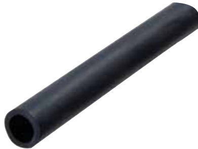
Table 3-98: Hose - Radiator Overflow