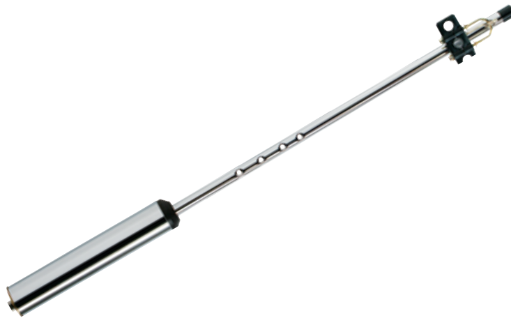
Table 3-81: Hose - Pogo Stick