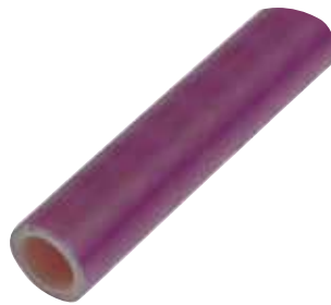
Table 3-4: Hose - Air Brake Hose