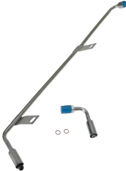
Table 3-63: Hose - HVAC - Freon Compressor Hose Assemblies