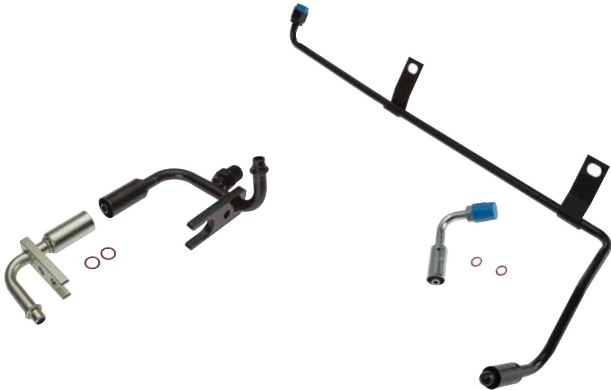
Table 3-59: Hose - HVAC - A/C Liquid Hose Assembly