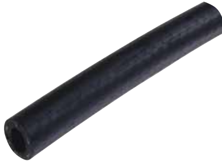
Table 3-20: Hose - Heater