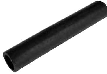
Table 3-22: Hose - General Purpose Heater Hose (Standard Duty)