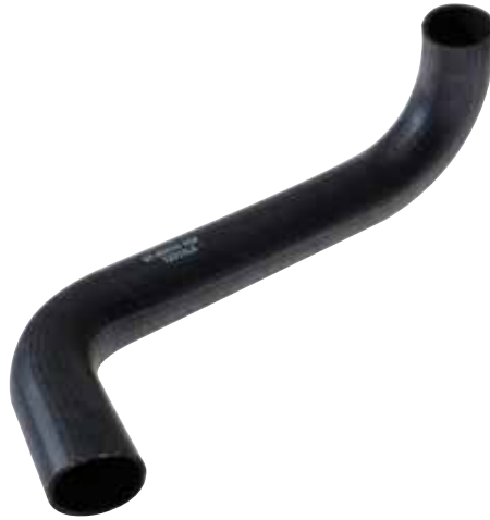
Table 3-99: Hose - Radiator Hose - Upper