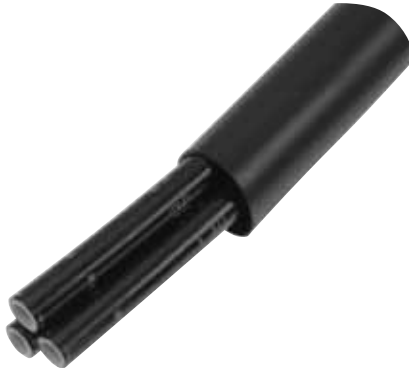
Table 3-19: Hose - Hand Valve Harness Hose