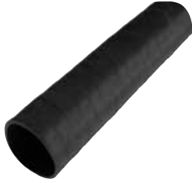
Table 3-92: Hose - Radiator Hose - J20R1 D/C 2-Ply 3"