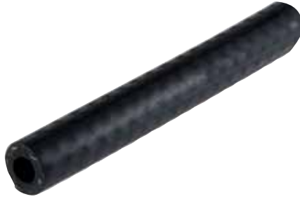
Table 3-18: Hose - Fuel & Oil Hose - 30R7