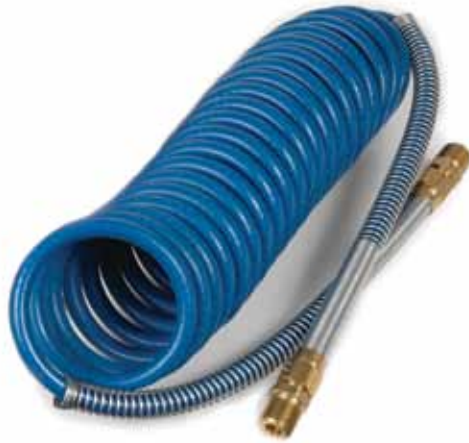
Table 3-11: Hose - Coiled Air Hose (Individual)