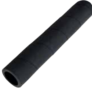
Table 3-90: Hose - Heavy Duty General Purpose Radiator Hose