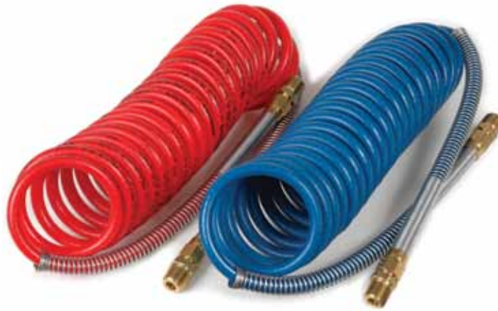
Table 3-12: Hose - Coiled Air Hose (Sets)