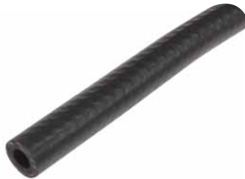
Table 3-17: Hose - Fuel & Oil Hardline