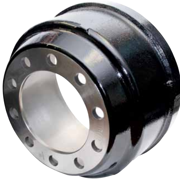
Table 4-3: Brake Drums