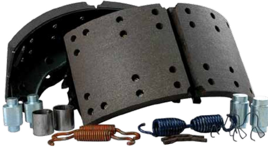
Table 4-4: Reman Brake Shoes