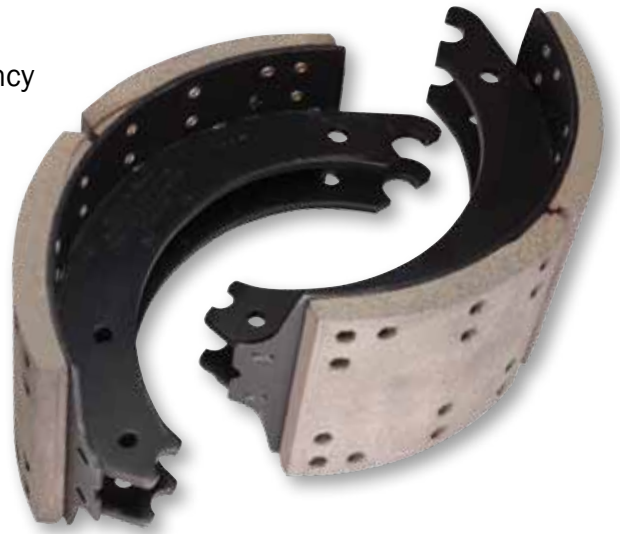
Table 4-6: New Brake Shoes

The TRP® heavy duty brake program exemplifies consistency in product quality, performance and value expected from TRP®. All products offered in the TRP® program meet or exceed FMVSS 121 standards at a competitive cost. Critical to the remanufacturing process is the treatment of the shoe itself before painting. All shoes go through an extensive cleaning and shot blasting preparation to guarantee excellent adhesion of the paint coating.