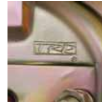
TRP® stamped into service chamber