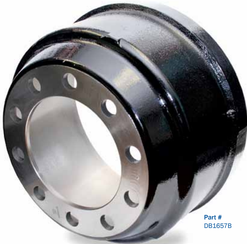
Part # DB1657B