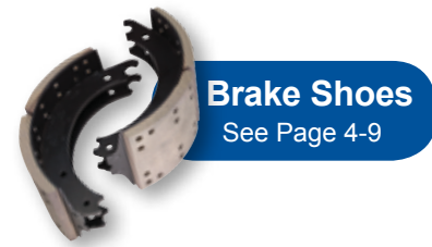
Brake Shoes See Page 4-9